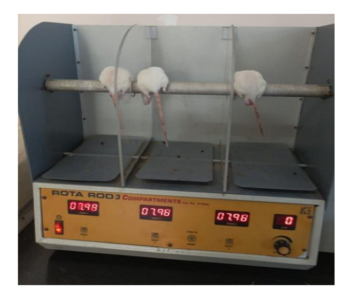
Figure 5.1 Rotarod apparatus

→ 2.5.2 Rota-Rod Test: This test is used in this study to establish the impact of Citrullus colocynthis ethanolic extract of rats with 6-OHDA lesions on the motor coordination of rats.