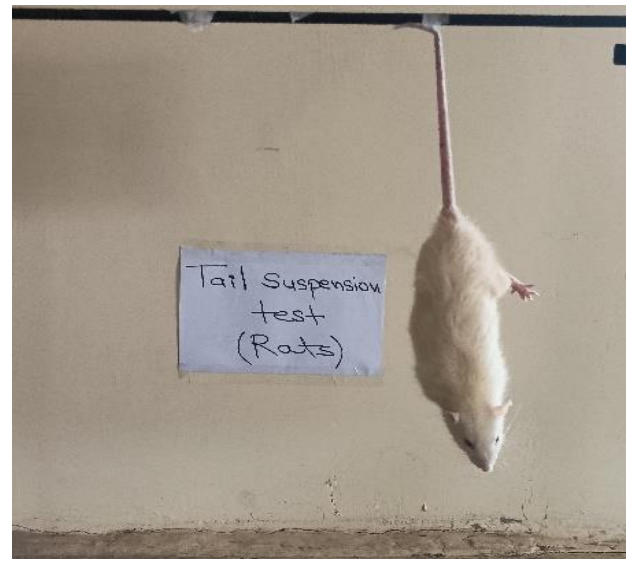
Figure 5.3 Tail Suspension Test

\rightarrow 2.5.3 Tail Suspension Test: The specific procedure that has been used involves modification of the TEST for PD models to non-motor function and assess capture depressive-like behaviour in mice (Can et al., 2012). In our study, we applied the TEST to investigate if C. colocynthis extract is likely to produce an antidepressant-like effect in rats with 6-OHDA lesions. Adhesive tape was placed approximately one centimetre from the extremity of rats' tails, and then the rats were hanged by the tails.