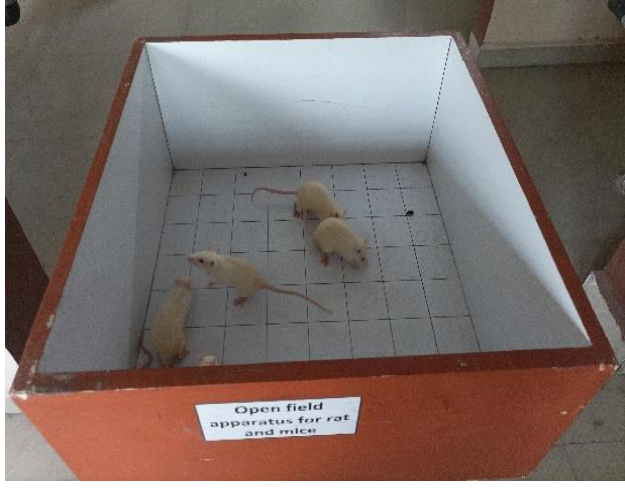
Figure 5.1 Open Field Test

and conditioned test was a 100 cm x 100 cm x 40 cm square arena with black walls, and the floor was divided into 25 equal squares. Five minutes of behaviour were recorded.