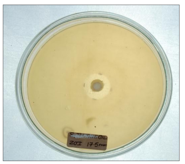
Figure 1: Zone of Inhibition shown by Karanj oil

Indian Journal of Health Care, Medical & Pharmacy Practice Vol 5; Issue 1, Jan-Jun 2024, ISSN 2583-2069