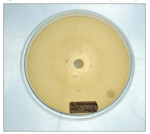
Figure 2: Zone of Inhibition shown by Ketoconazole